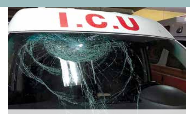
Palestinian ambulance windshield damaged by Israeli security forces' shooting.