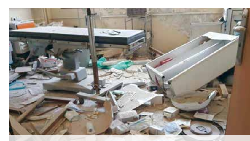
Aftermath of an attack on a SAMS-supported facility in Aleppo, Syria, November 2016.