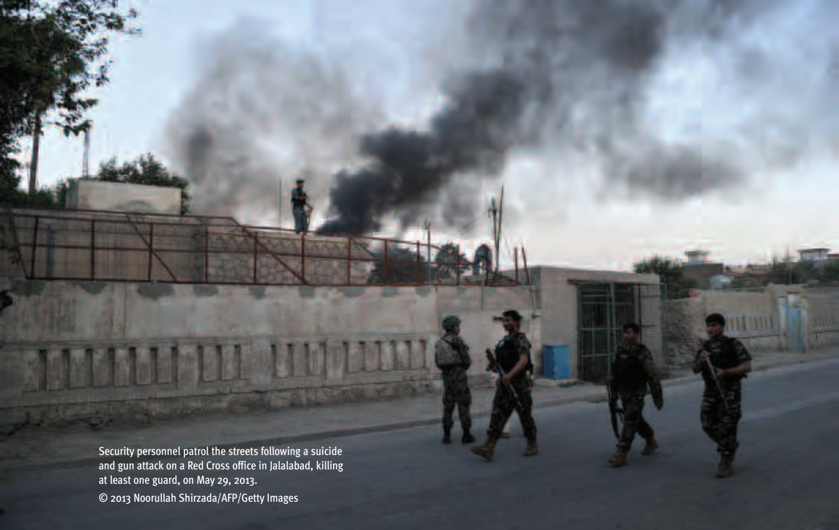
Security personnel patrol the streets following a suicide and gun attack on a Red Cross office in Jalalabad, killing at least one guard, on May 29, 2013.