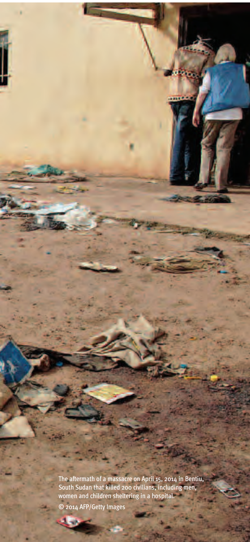
The aftermath of a massacre on April 15, 2014 in Bentiou, South Sudan that killed 200 civilians, including men, women and children sheltering in a hospital.