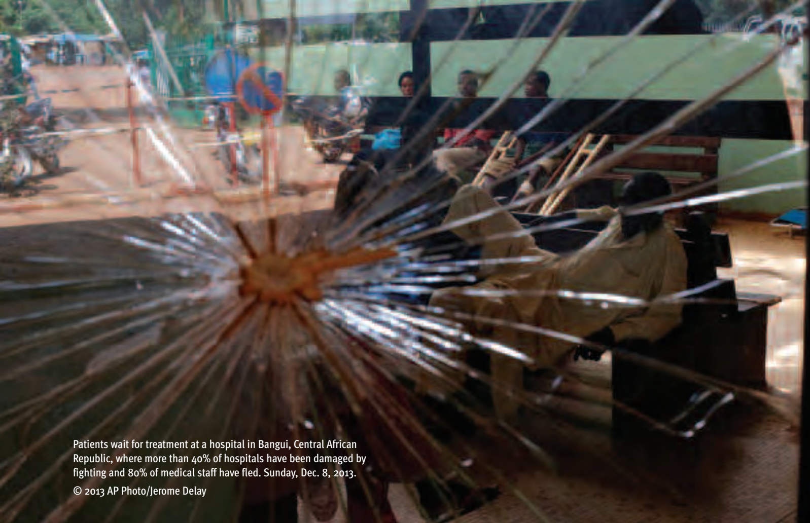
Patients wait for treatment at a hospital in Bangui, Central African Republic, where more than 40% of hospitals have been damaged by fighting and 80% of medical staff have fled. Sunday, Dec. 8, 2013.