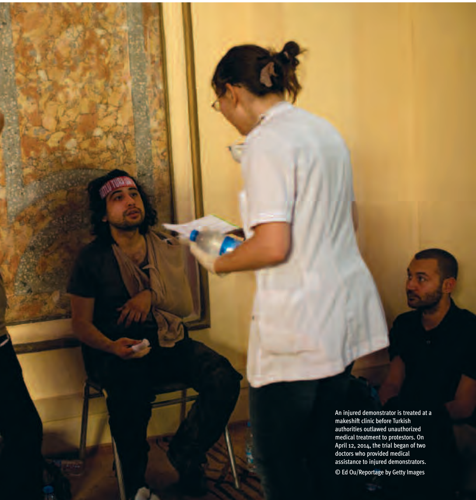
An injured demonstrator is treated at a makeshift clinic before Turkish authorities outlawed unauthorized medical treatment to protestors. On April 12, 2014, the trial began of two doctors who provided medical assistance to injured demonstrators.