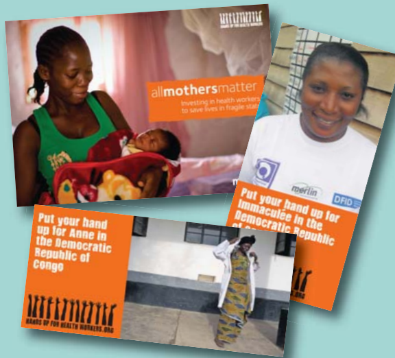
Front cover

Our campaign, Hands Up For Health Workers , calls for national governments and international donors to fund and implement comprehensive national health workforce plans, to ensure health workers in crisis countries are trained, paid, supported, equipped and protected.